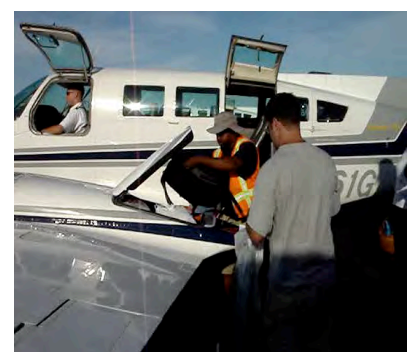
Lola 2 click here for video